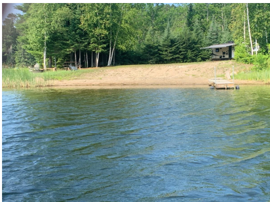
Striped shoreline with no protection displays erosion grooves and loss of aquatic habitat.