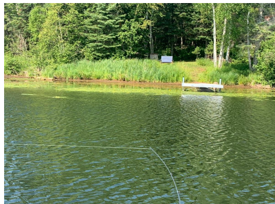
Great start working with a natural shoreline, to facilitate dock installation. (same lake)